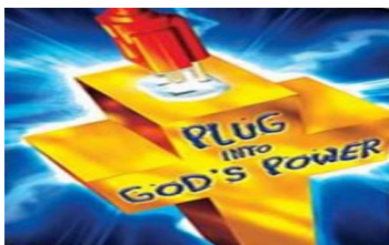
This Photo by Unknown Author